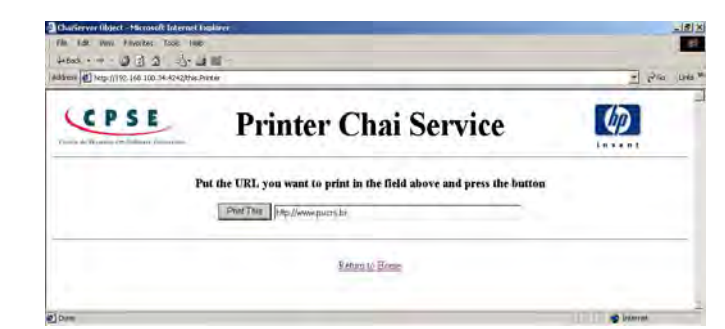
Figure 4 Printer Chai Service user interface