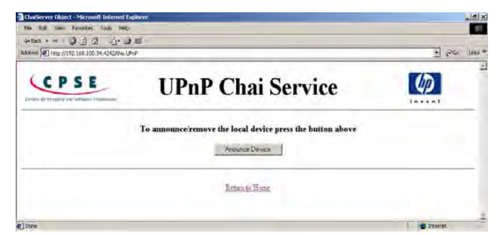
Figure 3 UPnP Chai Service user interface

The test was done with the ChaiServer installed in a computer that acts in the role of a print server.